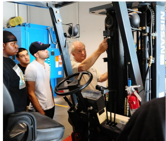
A CLA course at TCC

Instructor training began at TCC in April and at LCTI in October. We are pleased to report that we already have over 50 certified CLT instructors.